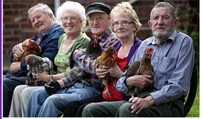
The hen project, which is supporting some 700 residents in more than 20 care homes in northeast England, was launched in London last week.

A project that lets people keep hens is reducing depression, loneliness and the need for antipsychotic medication for those in sheltered housing and care homes