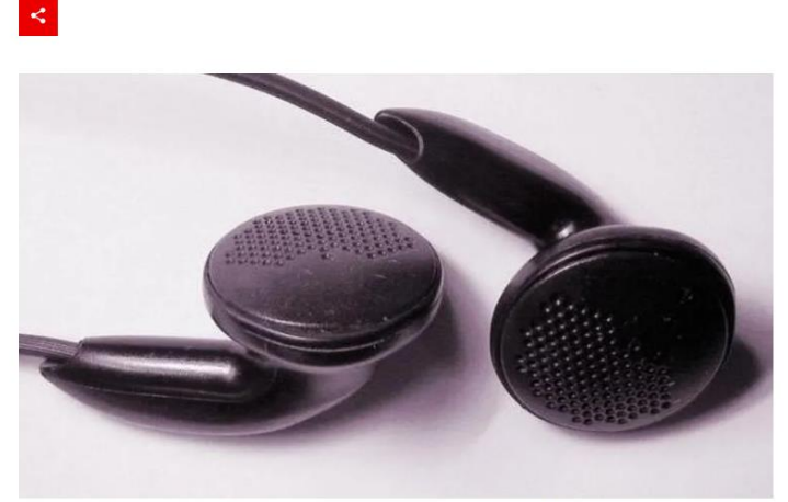
Researchers will investigate the effects of natural sounds on the mental health and wellbeing of older people

New research will explore whether the sounds of nature can have a positive impact on care home residents.